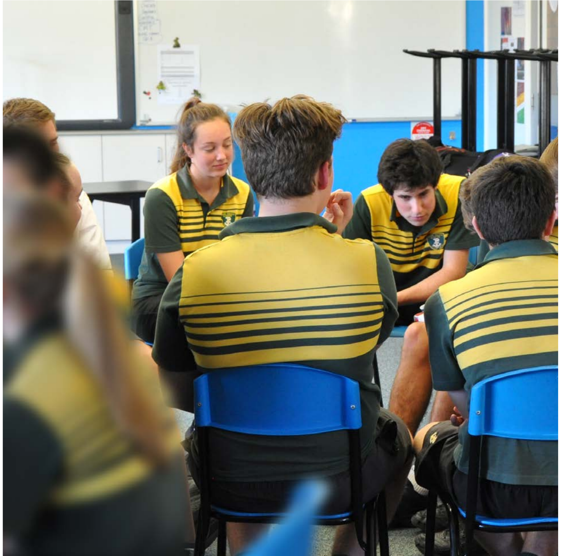
Above: Internal workshop – reviewing 10+ years of schools master planning

Project School master plan / Client Chanel College, Gladstone